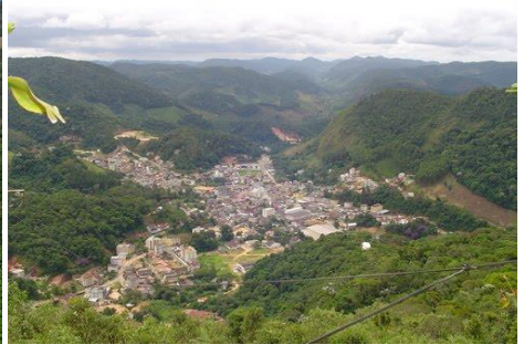
City of "Santa Teresa"/ES